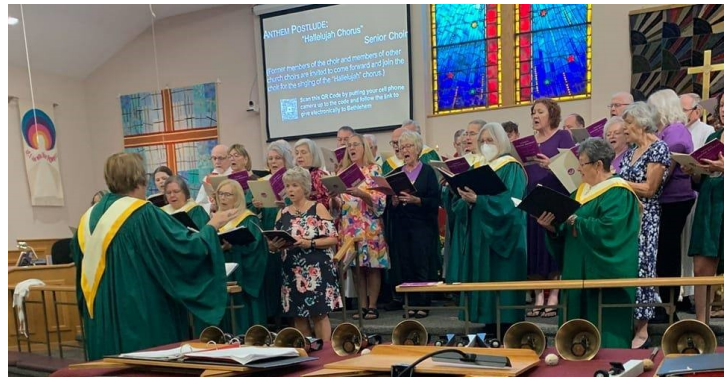
All Church Hallelujah chorus