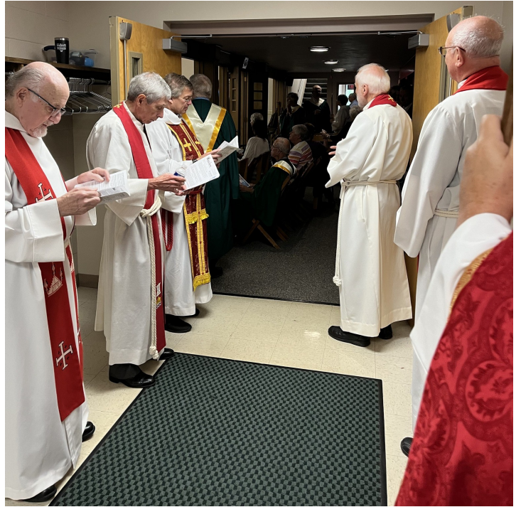
Past Pastors entering for worship