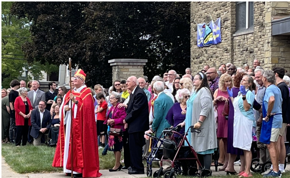
All Church Picture